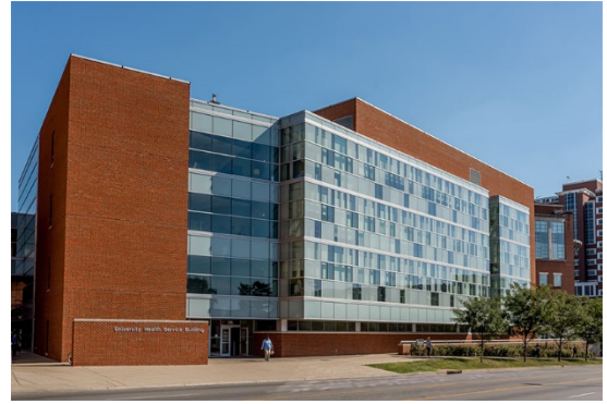
University Health Service Building (UHS)