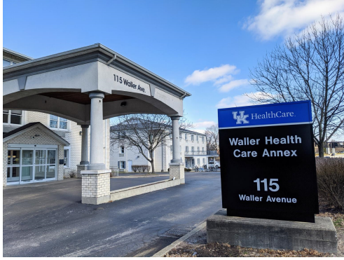
Pre-Employment Screening Office and Learning Center