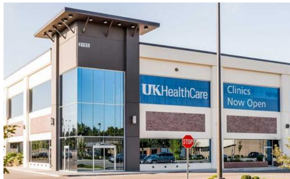
UK Healthcare at Turfland