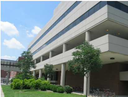
College of Nursing Building (CON)